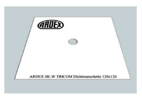
collar sleeve ARDEX SK-F/-W TRICOM 425 x 425 / 120 x 120