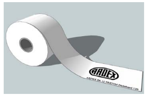
sealing tape ARDEX SK 12 TRICOM 120