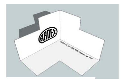
ingoing corner sleeve ARDEX SK 90 TRICOM