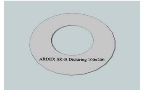
sealing tape ring ARDEX SK-B 100 x 200