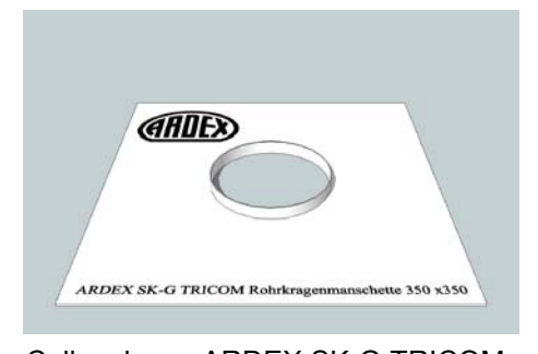
Collar sleeve ARDEX SK-G TRICOM 350 x 350

ARDEX SK-RTRICOM Dehnzonenmanschette 200x200