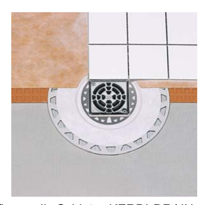
floor gully Schlüter-KERDI-DRAIN (not part of the kit)