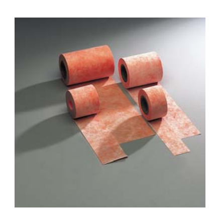
sealing tape Schlüter-KERDI-KEBA