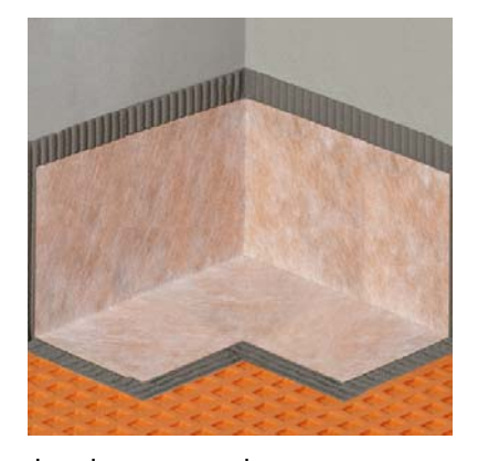
ingoing corner sleeve Schlüter-KERDI-KERECK