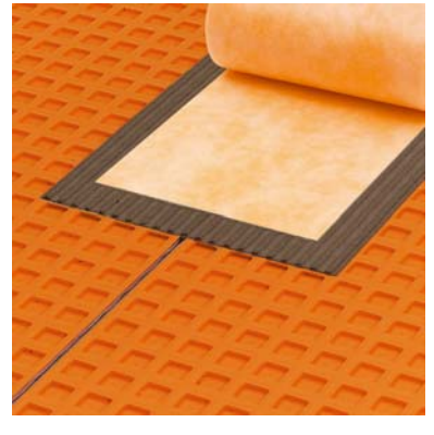
bonded sealing tape Schlüter-KERDI-KEBA