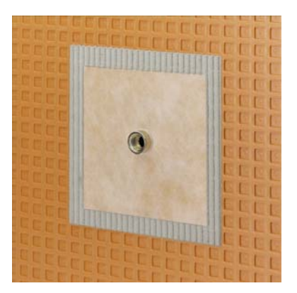
collar sleeve Schlüter-KERDI-KM