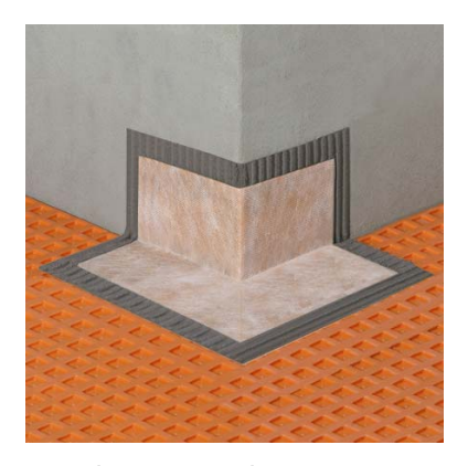
outgoing corner sleeve Schlüter-KERDI-KERECK