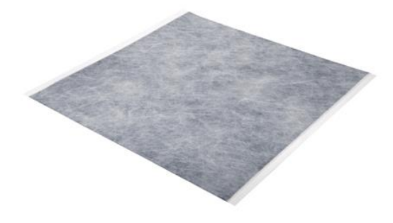
Hey´di Slukmansjett 37 x 37 cm/Hey´di Brunnsmanschett Enkelhäftande 37 x 37 cm