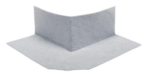
Hey´di Innvendig hjørne / Hey´di Innerhörn