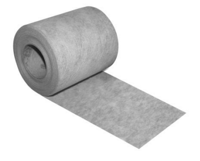
Hey´di Flexbånd / Hey´di Flexibelt Tätband