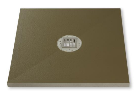
Example of a watertight board "Poresta BF xx"