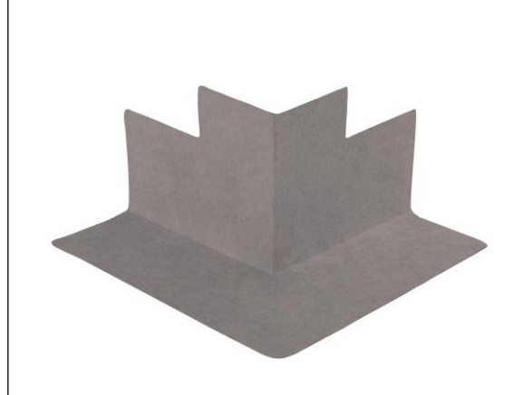
Outgoing Corner "Poresta® KMK TA"