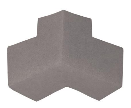
Dichtband-Innenecken "Poresta® KMK TI"