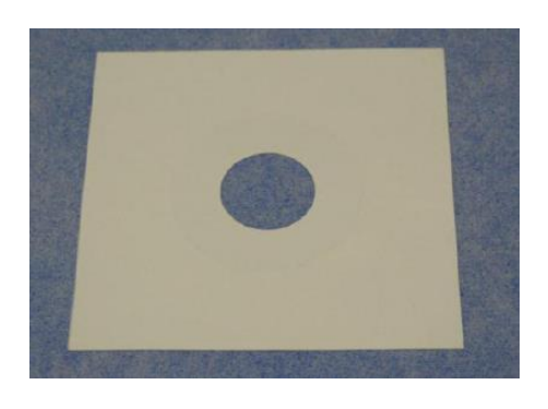
Sealing sleeve "Poresta KMK TM xx-xx"