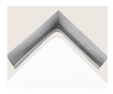
Ingoing Corner Dichtungsmanschette " Poresta® 3D TI