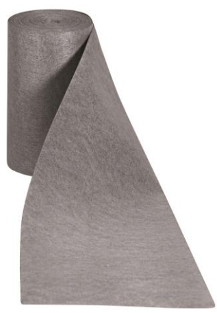
Sealing tape Dichtungsband "Poresta® KMK T"