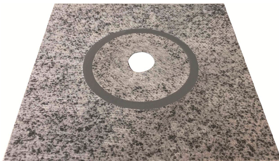
"ASO-Dichtmanschette-K 12 × 12 cm" "ASO-Dichtmanschette-K 15 × 15 cm" or "ASO-Dichtmanschette-K 25 × 25 cm"